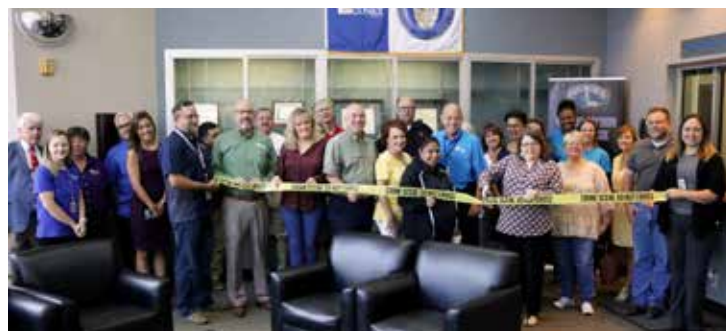
Bay Area Alliance for Youth and Families held a ribbon cutting at the Webster Police Department for the Medication Drop Box.