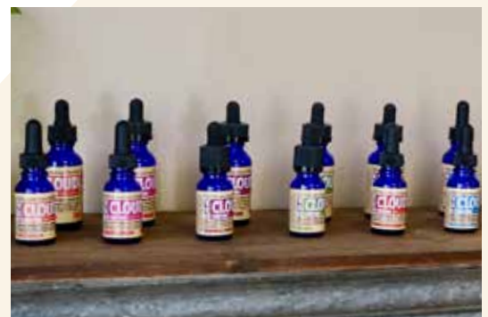
American Shaman offers a wide array of CBD products, including several different flavors of the oil.