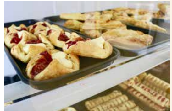
Delicious pastries can be found at El Shaddai in Webster, now open!

The Game Preserve is a unique venue with over 125 arcade games. Guests can purchase a day pass or monthly membership. Snacks and drinks are available, and the venue is BYOB.