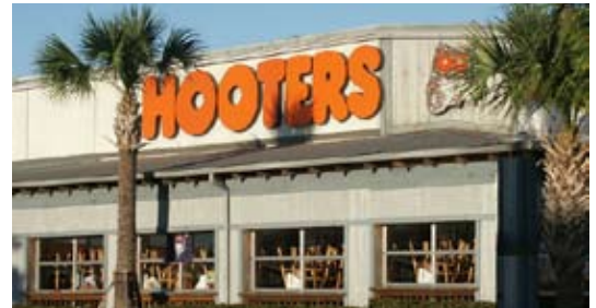
Webster's Hooters continually performs within the top ten world-wide.