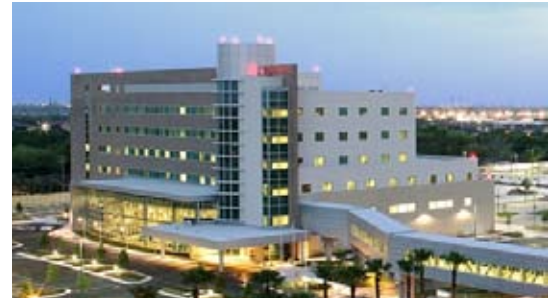
The renowned Clear Lake Regional Medical Center completed the Heart & Vascular Hospital in 2007.

Johnson Space Center, NASA Mission Control, and United States Human Space Exploration activities account for more than 17,000 jobs with more than $2.5 billion in personal income, a highly-educated workforce, and strong community partnerships. Lockheed Martin Corp. was awarded the contract to design, develop, and build Orion, NASA's shuttle successor. The Orion contract is valued at $4.2 billion and is expected to create 1,100 jobs for the Webster area. JSC administers over $4 billion in federal aerospace contracts annually.