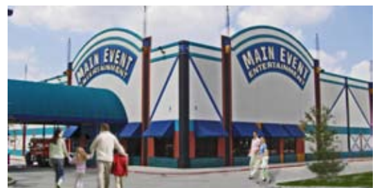
Main Event Entertainment features its top-performing location in Webster.