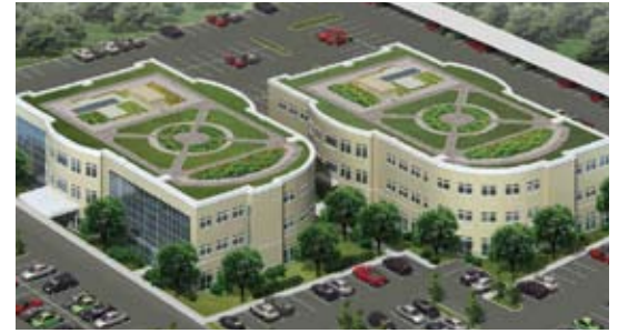
251 Medical Center Boulevard is the region's first Gold LEED-certified medical facility and features the State's largest living roof.