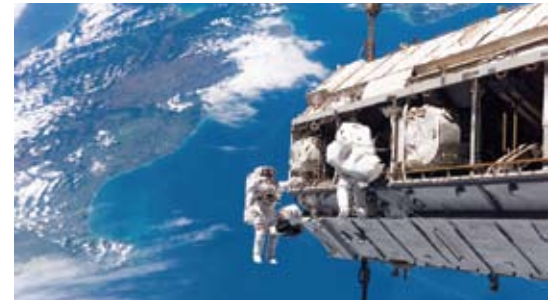
JSC, located in Webster's backyard, is "Mission Control" for human space flight.