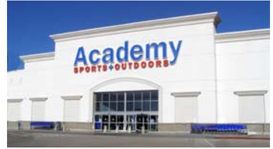
Academy choose Webster to build its largest Texas Store.

Webster's tourism partner, Space Center Houston, NASA's official visitors' center, accounts for a significant visitor population that shops, dines, stays, and plays in the City. More than 3,000,000 visitors land in the Webster market annually. Webster's retail