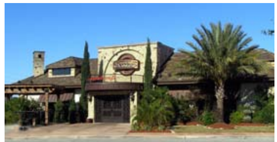
Webster's Cheddar's Casual Café performs as the number two store in the chain of more than 60 locations.