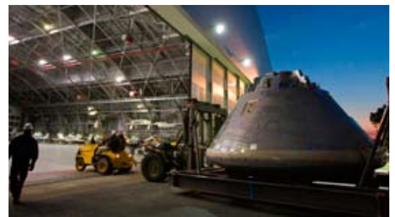
Future astronauts will fly into space aboard Lockheed Martin's Orion space capsule, which is being developed in Webster.