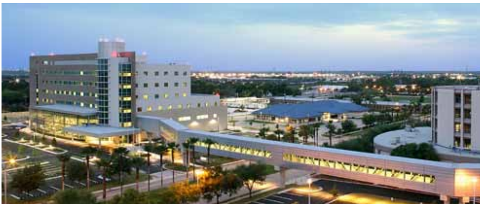
Clear Lake Regional Medical Center recently completed the top two floors of the Heart & Vascular Hospital.