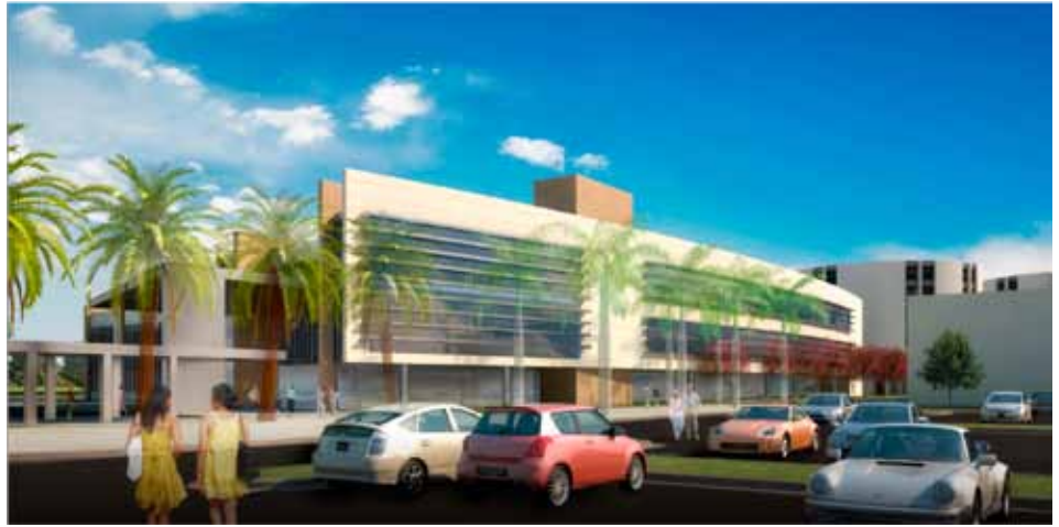
Clear Lake Regional Medical Center's new patient tower enhances the Medical Center of the South's formula for success: world-class healthcare, easy access, and convenient, free parking.

Prior to Kimmel's arrival, at a hint of pediatric surgical issues, the patient would be transferred to a specialized hospital in Houston's medical center.