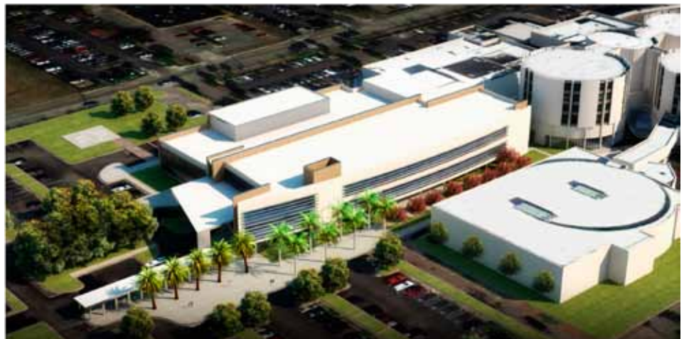
Clear Lake Regional Medical Center's campus is expanding to accommodate its burgeoning service-area population.

The medical center of the south is keeping pace with the super-regional population it serves and the commitment to provide world-class healthcare. To accomplish this mission, Bay Area Regional Medical Center is, once again, under construction, and Clear Lake Regional Medical Center is embarking on another huge project that will transform the healthcare landscape.